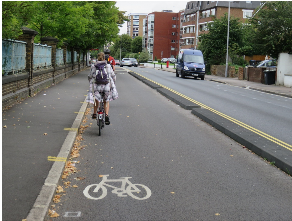
Figure 1: new cycle track, Kingston (Rachel Aldred)