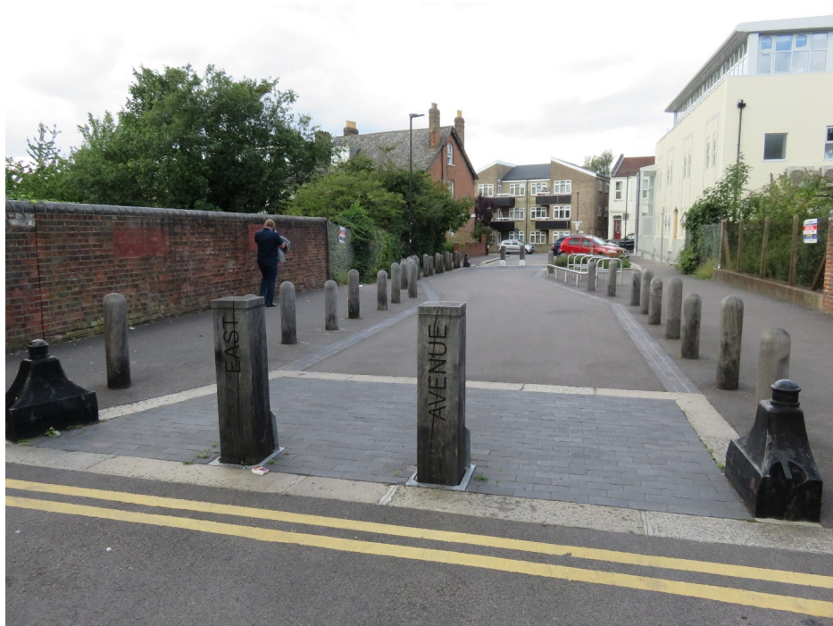
Figure 2: modal filter, Waltham Forest (Rachel Aldred)