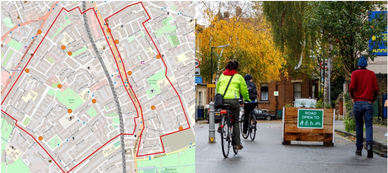
Figure 1. An example of a low traffic neighbourhood in Walworth, Southwark (South London).

Left side: New modal filters in 14 places (orange dots) create two low traffic neighbourhoods (red) in Walworth, South London. All homes can be accessed by motor vehicle, but one cannot drive straight through the area. Right side: An example of one of the Walworth modal filters, which blocks motor traffic while allowing pedestrians and cycles to pass freely. This modal filter uses physical barriers, but other modal filters are enforced with cameras.